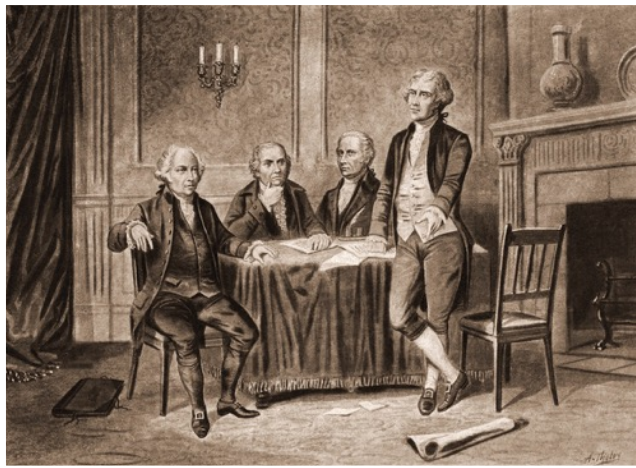
Illustration of four delegates to the Continental Congress From left to right, John Adams, Robert Morris, Alexander Hamilton, and Thomas Jefferson.