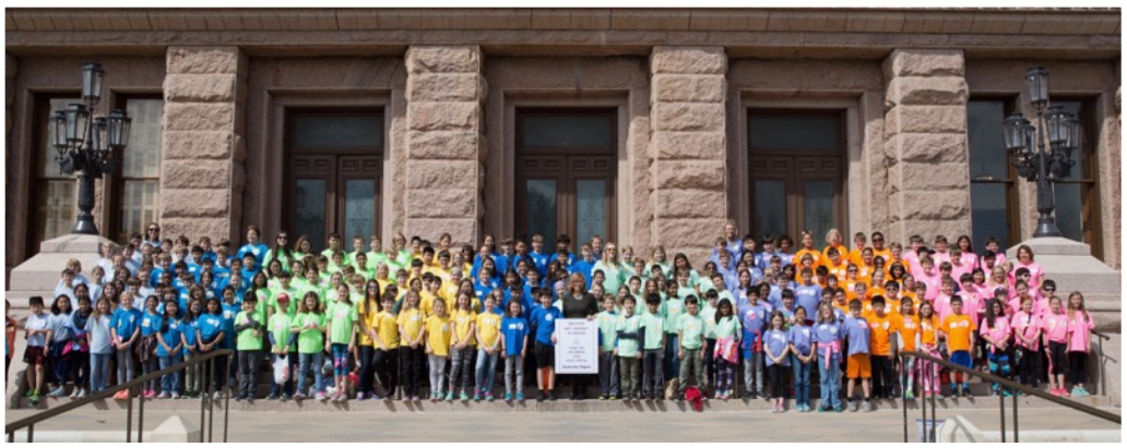
4th Grade class at the state capital last year.

In the Texas Spirit Theater, you could take a journey through Texas history with the film, Star of Destiny or you